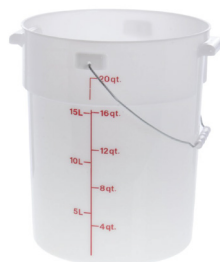
5-Gallon Buckets & Lids (2)