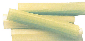
CELERY 1 stalk