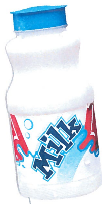
2% REDUCED FAT MILK 1 cup