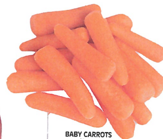
BABY CARROTS 1/2 cup