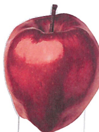
APPLE 1 medium