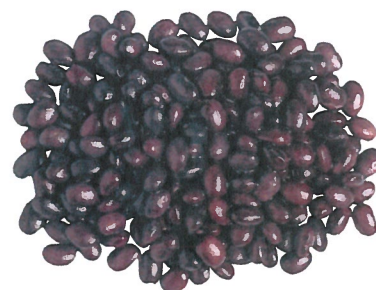
BLACK BEANS 1/2 cup