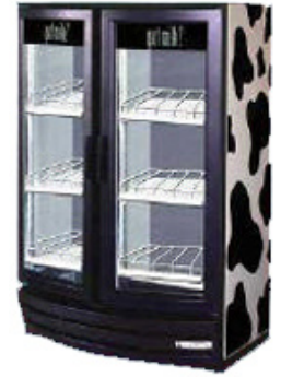
MT 27 $2,488*