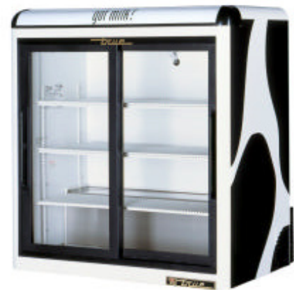
GDM 9 $1,632* GDM 9 PT $2,501*