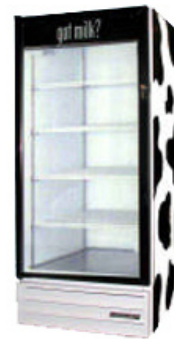
MT 12 $1,173*