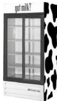
MT 38 $1,961*