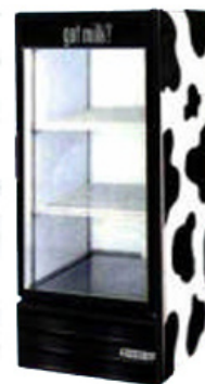
MT 10 $1,157*