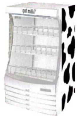
BZ 13 $2,928*