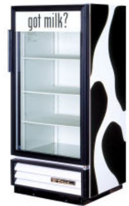
GDM 10 $1,459* GDM 10PT $1,844*