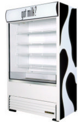
TAC 48 $4,267*