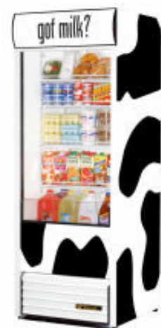
TAC 30 $3,971*