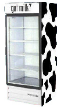
MT 27 $1,450*