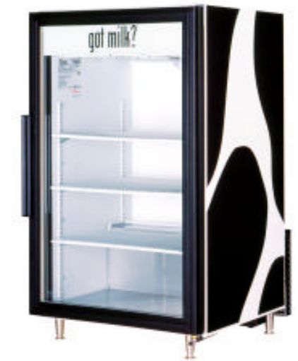
GDM 7 $1,263*