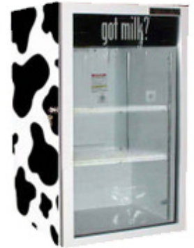
UR 30 $1,051* (half shelf not pictured)