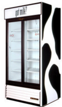
GDM 33 $2,194* GDM 33C-PT $2,777*