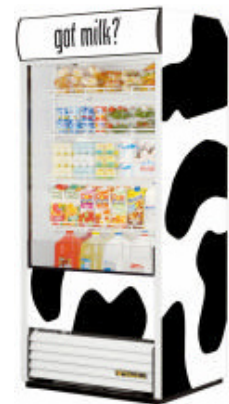
TAC 36 $4,070*