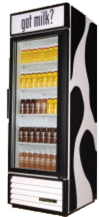
GDM 23 $1,721*